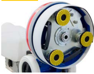
Pad Holder PADS