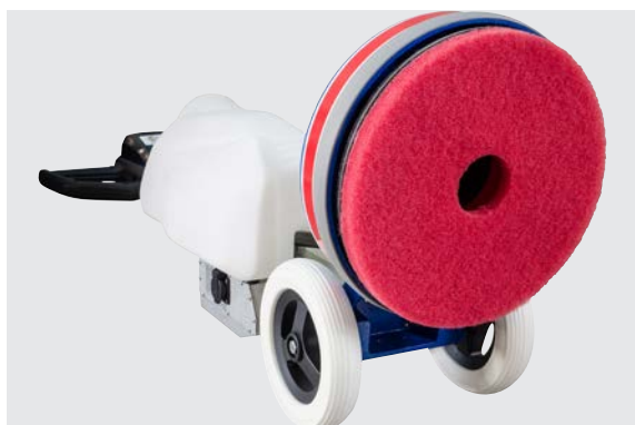
Additional 220V socket.