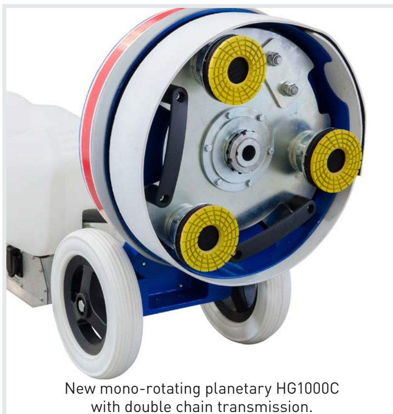
New mono-rotating planetary HG1000C with double chain transmission.