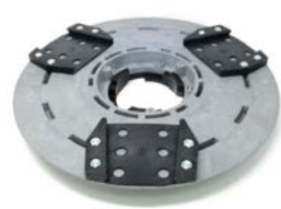
Spiral diamond pads