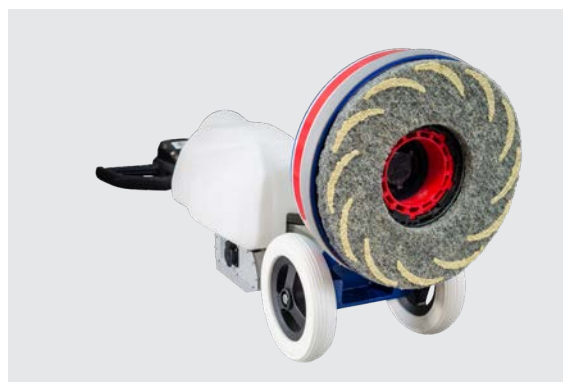
With the pad holder 17 "uses all the Abrasive pads and the SPIRAL 17" diamond pads.