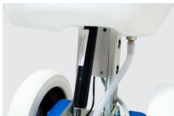
Micro-metric handle adjustment system(optional).