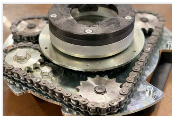
Planetary with hardened steel gears for maximum reliability and performance.