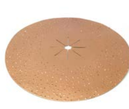
Plate with 3 Satellit